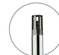
High Quality Sensor